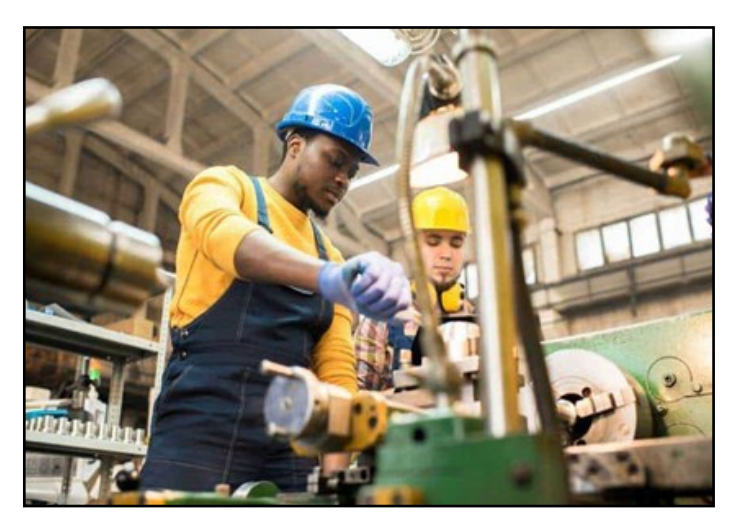
Students training in manufacturing jobs.

The Technical College System of Georgia (TCSG), Office of Workforce Development (OWD) awarded WorkSource Southern Georgia